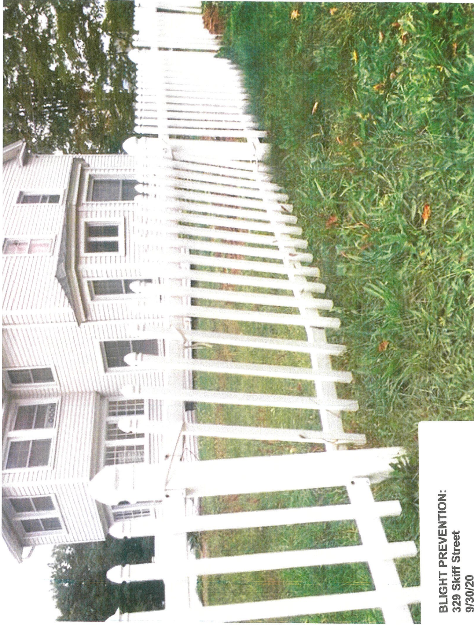
BLIGHT PREVENTION: 329 Skiff Street 9/30/20