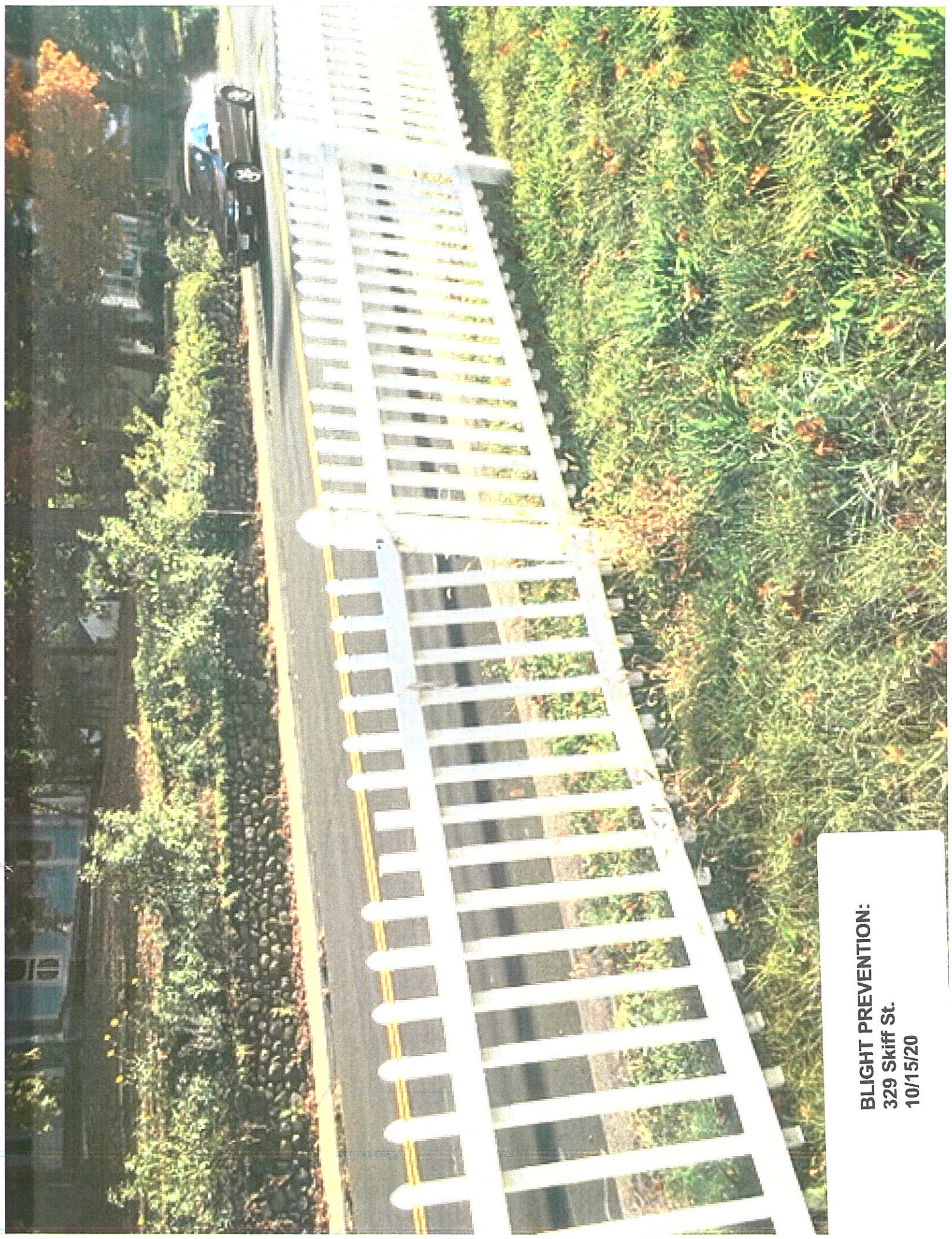
BLIGHT PREVENTION: 329 Skiff St. 10/15/20