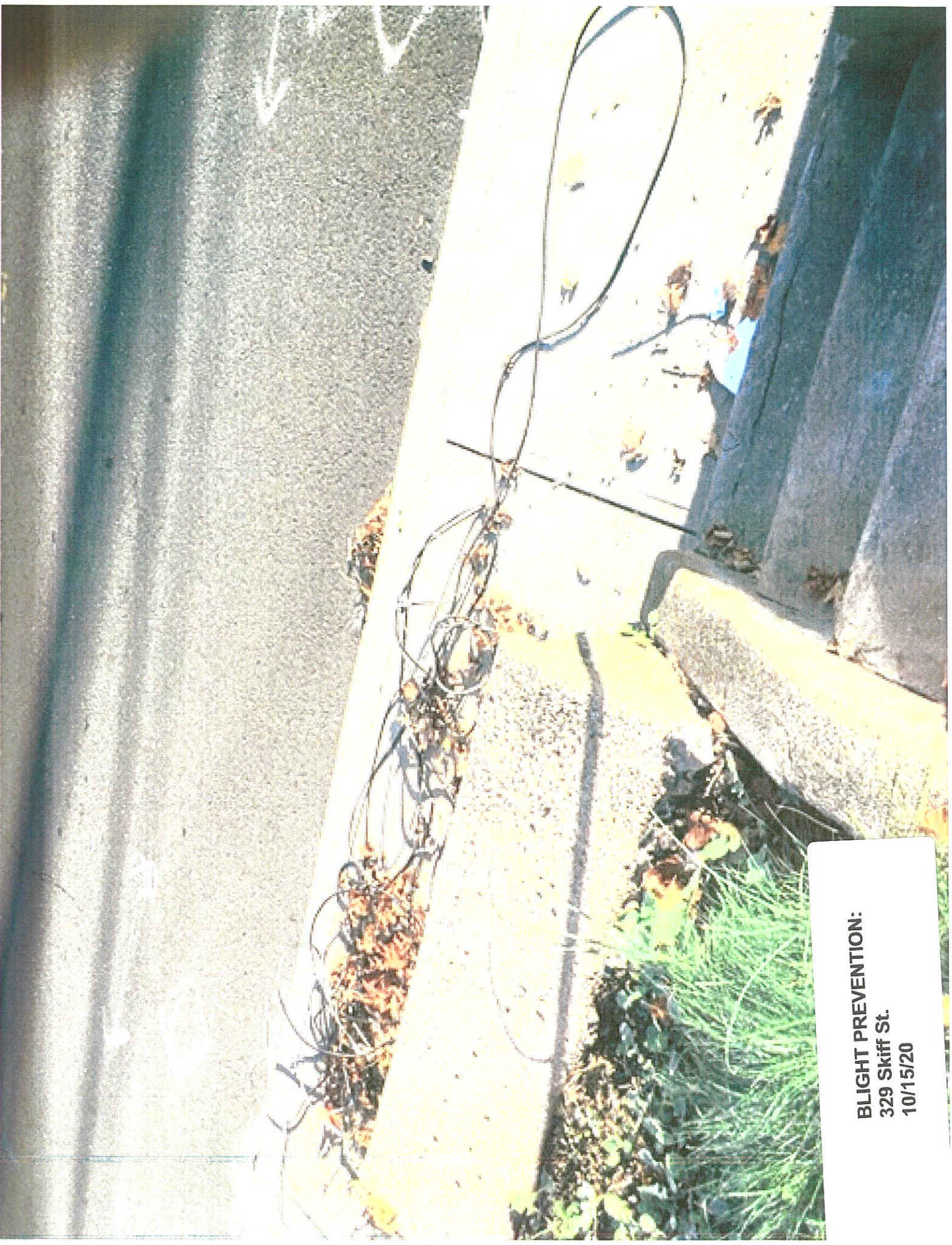
BLIGHT PREVENTION: 329 Skiff St. 10/15/20