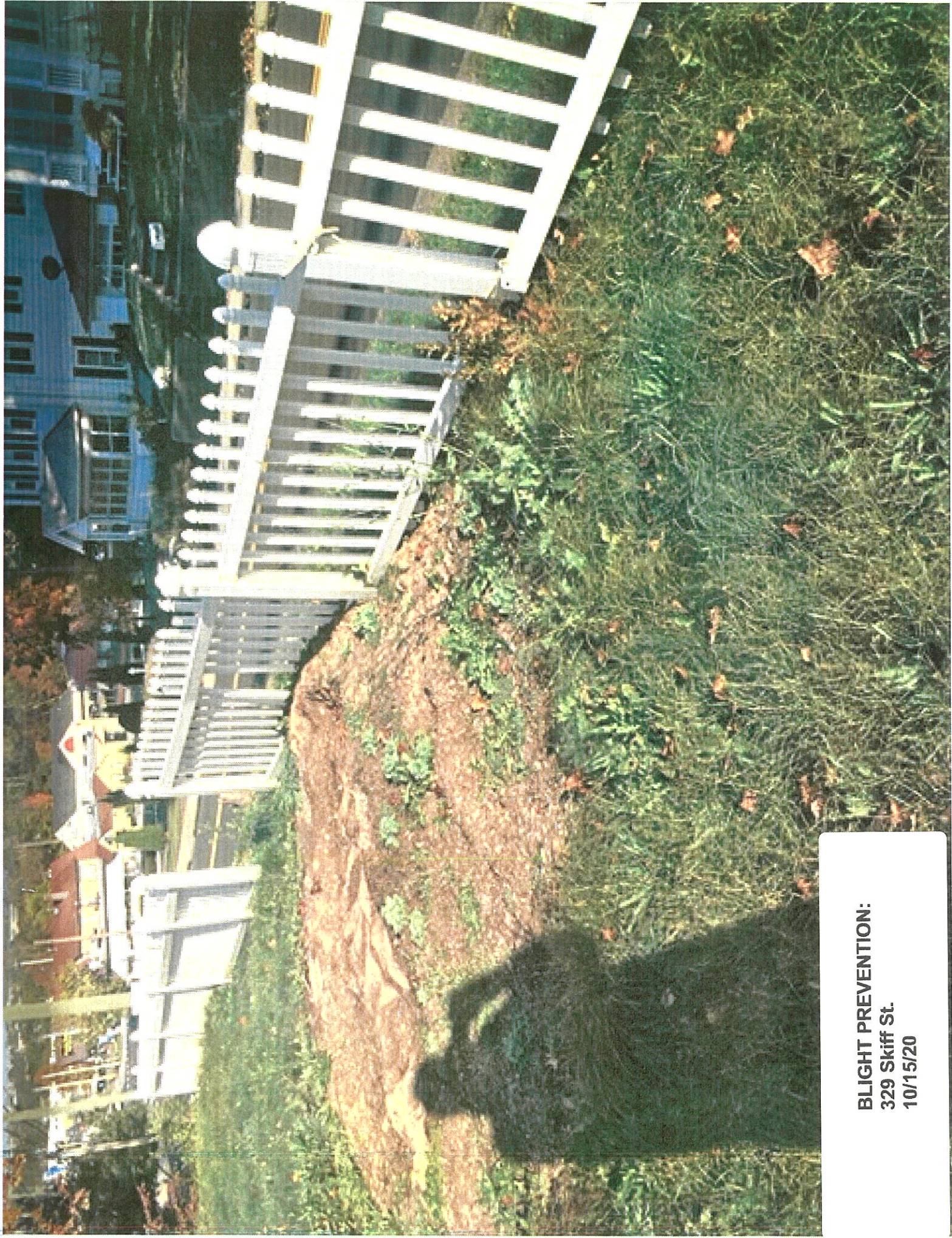
BLIGHT PREVENTION: 329 Skiff St. 10/15/20