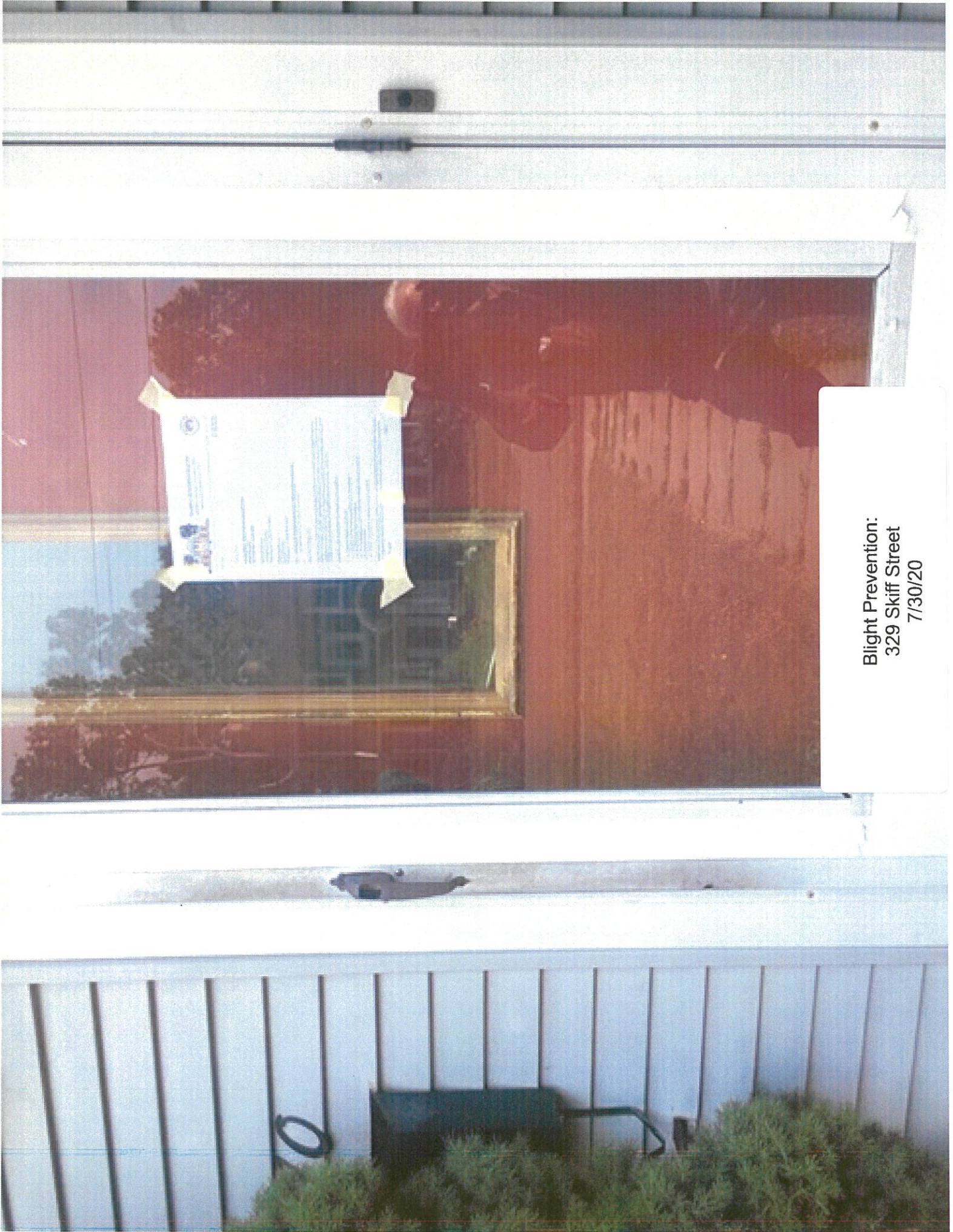
Blight Prevention: 329 Skiff Street 7/30/20