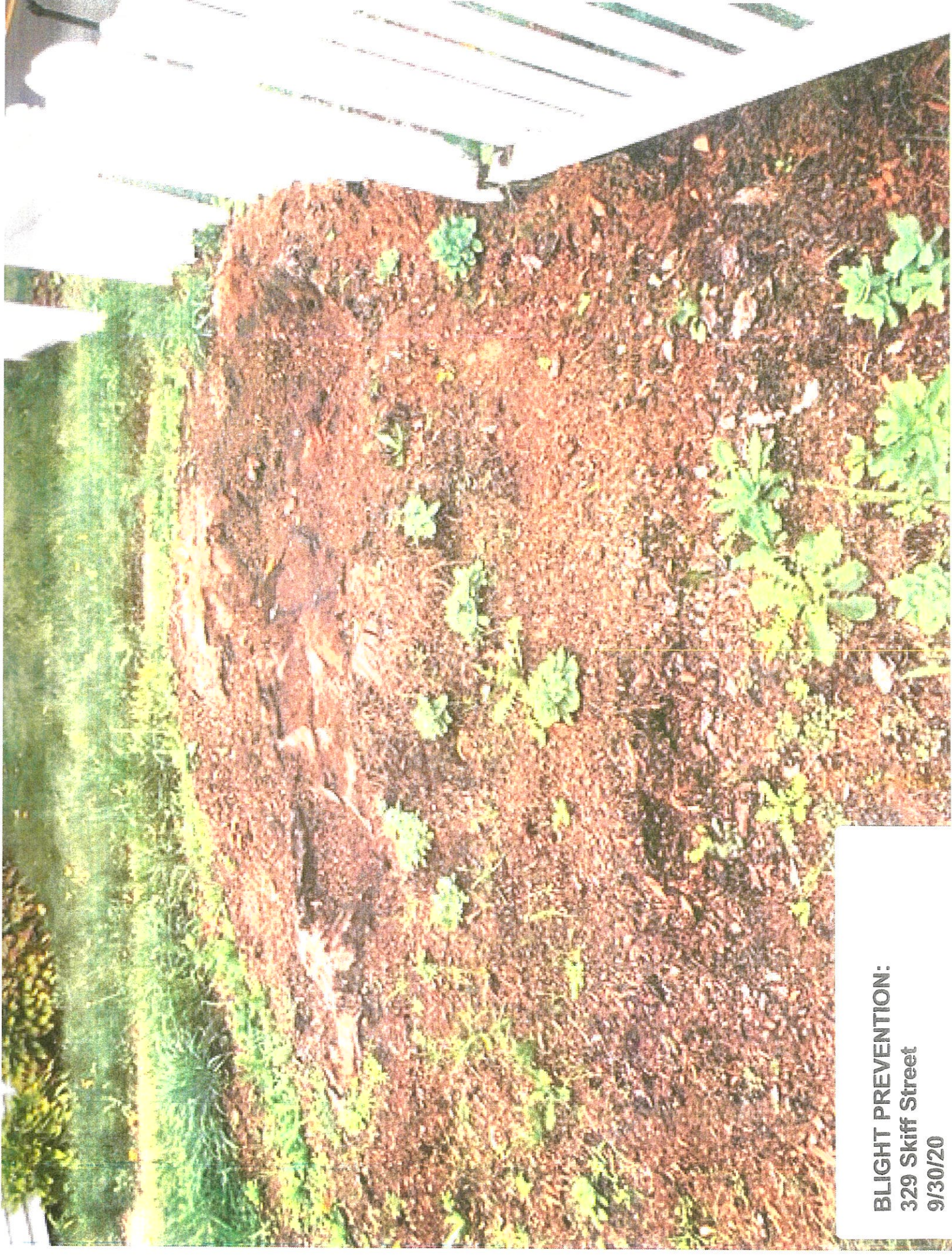
BLIGHT PREVENTION: 329 Skiff Street 9/30/20